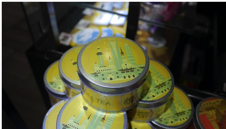
Figure 4: Merchandise, Shanghai World Financial Center.

How easily could we recognise processes of inscription and differentiate them from processes of forth-scription? How to differentiate between images of power and images of empowering?