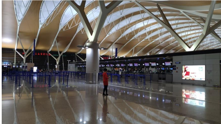
Figure 2: Pudong Airport - interior view.

populate every urban centre that is considered important. They are symbolic of an everywhere and nowhere, of ubiquitous communication and trade. They are symbolic of a world whose life we just recently saw halted.