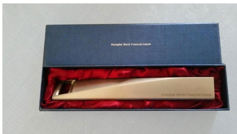
Figure 1: Shanghai World Financial Center, merchandise, bottle opener.

The large bottle opener mimicking Shanghai's World Financial Center is somewhat cumbersome for quotidian use, but it appears well placed on a shelf in front of a poster announcing the movie Masculin Féminin – a film by Jean-Luc Godard from the mid-sixties whose famous intertitle The Children of Marx and Coca-Cola suggests this paper's thesis. China resists attitudes that attempt at analysis and conclusion on the basis of clear-cut categories. 1