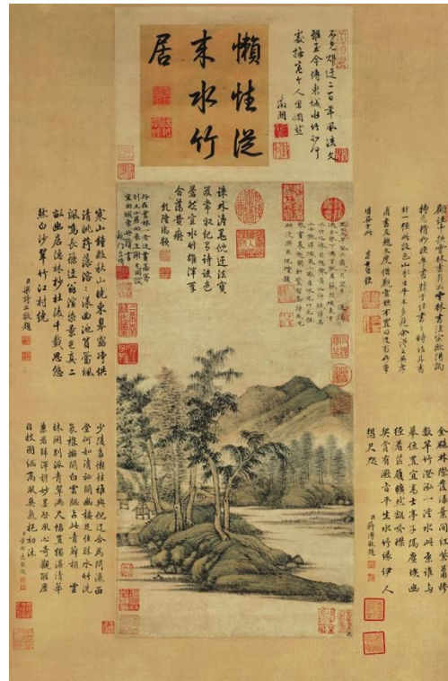
Figure 6: Dwelling amidst Water and Bamboo (水竹居圖), Ni Zan (倪瓚, 1301-1374), Yuan Dynasty (1279-1368). Hanging scroll, ink and colour on paper, 53.6 x 27.7 cm, National Museum of China, Beijing.