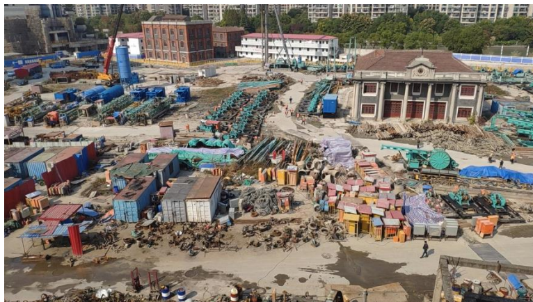
Figure 5: Workers on the way to their lunch break on the construction site of the ‘1000 Trees’ project by Heatherwick Studio, Shanghai, November 2019.

China’s household registration system allows only those with the hukou of a specific place access to its social security system and its educational facilities. 10 Importantly, the system restricts the access of those with rural hukou to the social security systems of urban China. While China has initiated the reform of the household registration system, the process is slow. There are numerous worries. China’s cities have already grown at an unprecedented speed. There is fear this growth could run out of control. There are also worries that the decline of the work force in the countryside will lead to problems with the country’s food production, not keeping up with the demands of its enormous population. The production of rice, the population’s main food, still depends on manual labour. That there are relevant and understandable reasons for why hukou system is still in place, however, does not undo its harshness for parts of China’s population. Admittedly, local governments in China have for some time engaged in experiments at various scales that aim at a better understanding of how living in the countryside could become a sustainable alternative to living in the city, and what kind of business models would work in rural China. 11 At the moment, the money made in the city flows into the countryside to support both the elderly and children who have stayed at ‘home’.